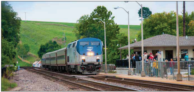
The Missouri River Runner stops at the new Hermann depot.

of Transportation (MoDOT). It sponsors the Missouri Rail Passenger Advisory Committee, which through quarterly meetings brings together key stakeholders from along the route to discuss common issues, including promotion of train service. MoDOT also offers stipends for station improvements and marketing and runs a Missouri River Runner Facebook page.